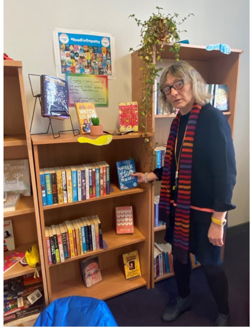
Quotes from Nicolson Institute Volunteer Junior Librarians: