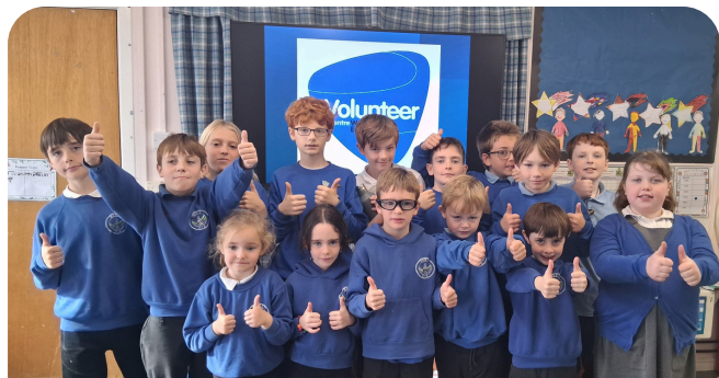
Pupils from Sgoil Uig in Lewis give a thumbs up for volunteering!