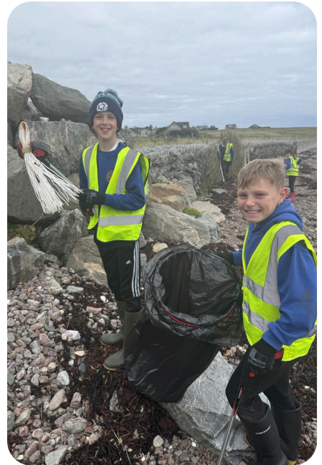
Tong Primary pupils take part in a community clean-up (above); Learning about volunteering with VCWI (left)