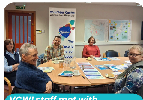
VCWI staff met with community reps in Barra

The VCWI Barra office welcomed a range of local organisations to its Volunteer Network gathering in the Barra Learning Centre in October. The meeting offered an opportunity to hear updates from across the community and to share perspectives on current priorities. Representatives from Barra Thrift Shop, Castlebay School, Barra Running Club, Carbon Neutral Islands, Buth Bharraigh and the Barra Ranger Service took part, each outlining recent activities and future plans.