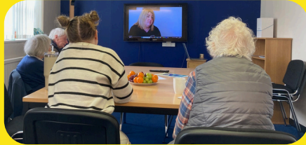
Speakers at OH-COP2 (top); Tuning in from Uist (bottom)