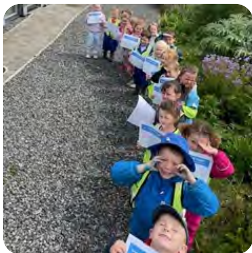
Junior litter pickers in Harris & Barra (top & bottom left) & keen gardeners at Tagas Uibhist Community Gardens (right)