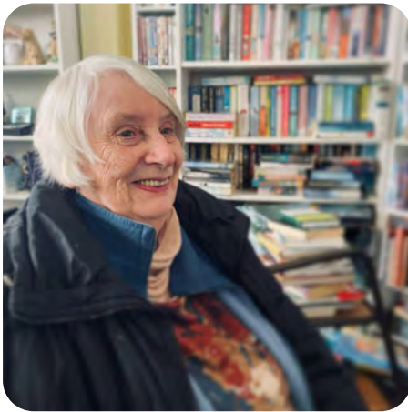
Volunteers at Benbecula Thrift Shop (left) & preparing for Eilean Dorcha Festival (right)